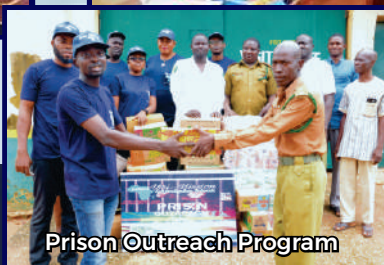
Prison Outreach Program