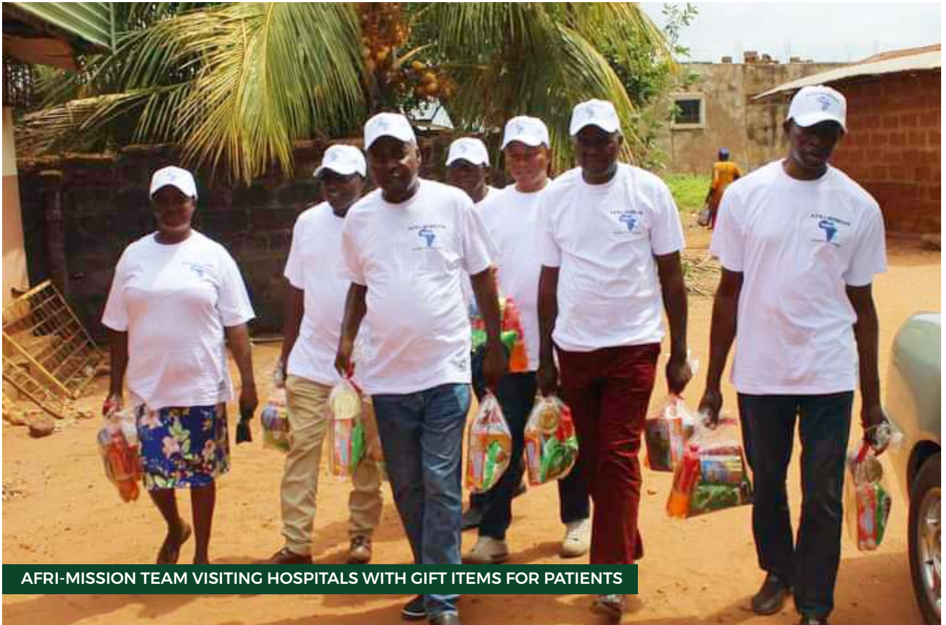
AFRI-MISSION TEAM VISITING HOSPITALS WITH GIFT ITEMS FOR PATIENTS