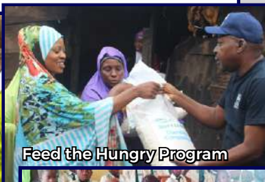
Feed the Hungry Program