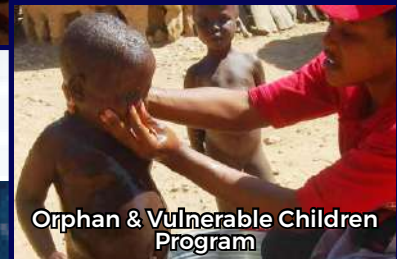
Orphan & Vulnerable Children Program

The Humanitarian Service Directorate of Afri-Mission and Evangelism Network is committed to helping the helpless who are underserved, oppressed, marginalized, discriminated against and stigmatized. We carry out projects to address poverty, hunger, nudity, sickness, incarceration, rejection, illiteracy, clean water scarcity, and homelessness.