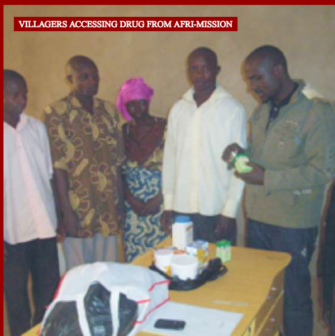
VILLAGERS ACCESSING DRUG FROM AFRI-MISSION