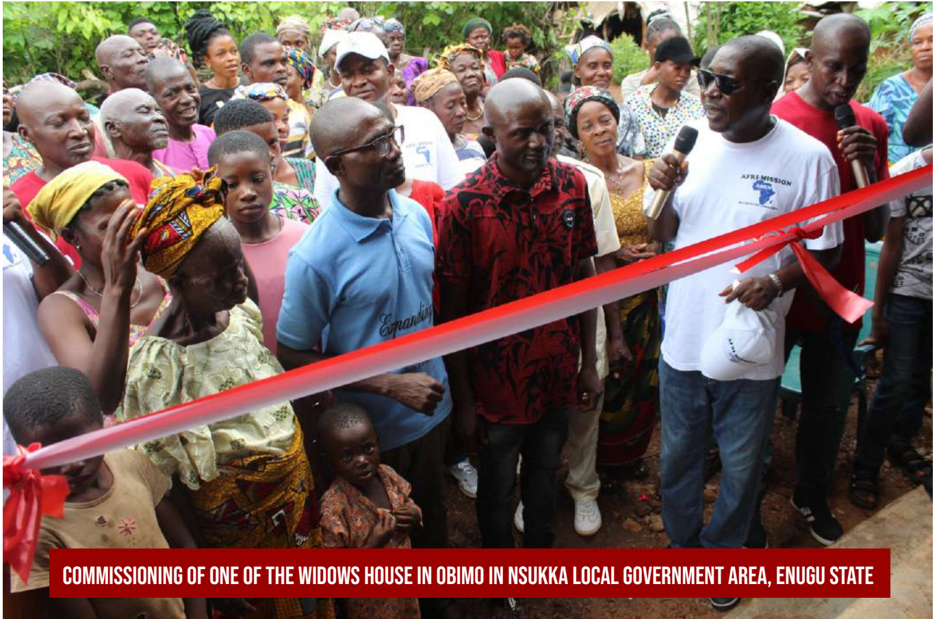
COMMISSIONING OF ONE OF THE WIDOWS HOUSE IN OBIMO IN NSUKKA LOCAL GOVERNMENT AREA, ENUGU STATE

These homeless widows and children who do not have a place to lay their heads got a change of life through Afri-Mission intervention. It is not just that Afri-Mission constructed houses for them but these houses were furnished exotically with upholstered seat, televisions, fans, beds, curtains and satellite dishes.