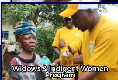
Widows & Indigent Women Program