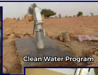
Clean Water Program