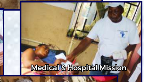
Medical & Hospital Mission