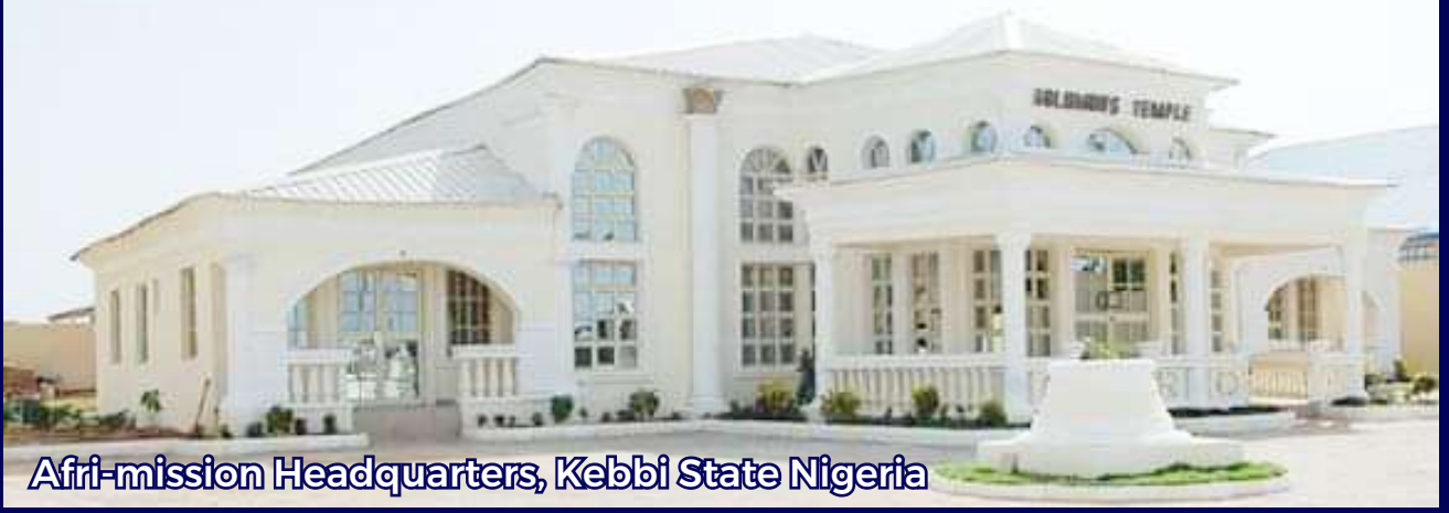
Afri-mission Headquarters, Kebbi State Nigeria

Afri-Mission and Evangelism Network is a faith-based not-for-profit organization with the mandate to take the gospel to the unreached and help the helpless. We are Incorporated under the Companies and Allied Matter Act 1990 by the Corporate Affairs Commission of the Federal Republic of Nigeria.