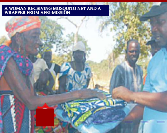
A WOMAN RECEIVING MOSQUITO NET AND A WRAPPER FROM AFRI-MISSION

M any families, particularly those in rural areas, lack access to basic healthcare services. This has resulted in high mortality especially among children and women. In all our Target areas there are no presence of any primary health care and herbalists and traditional birth attendants are their doctors and midwives. We visit our target areas with medical teams to offer medical services to the people in order to cushion the effect of lack of primary health care in